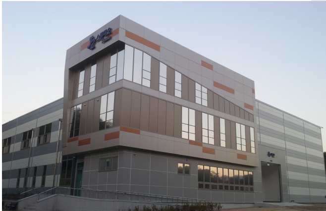
Jeonju Cinema Studio

Contact | Jeonju Film Commission | +82 63 222 0244 | jifclt@naver.com