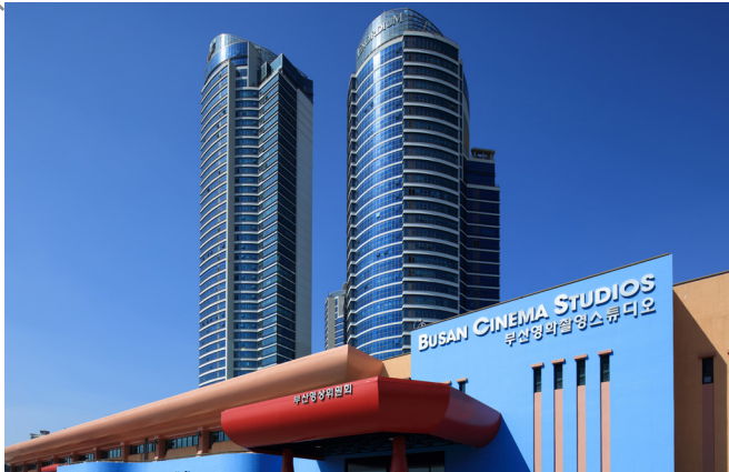
Busan Film Studios

Contact | Busan Film Commission | +82 51 720 0314 | hck71@filmbusan.kr