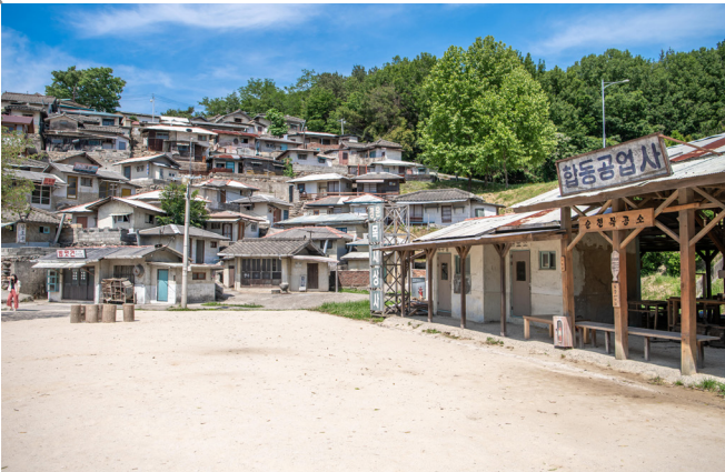
Suncheon Drama Set

Contact | Jeonnam Film Commission | +82 61 744 2272 | jnfc2271@naver.com